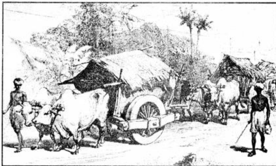
Departure to nearby towns and cities in search of food.