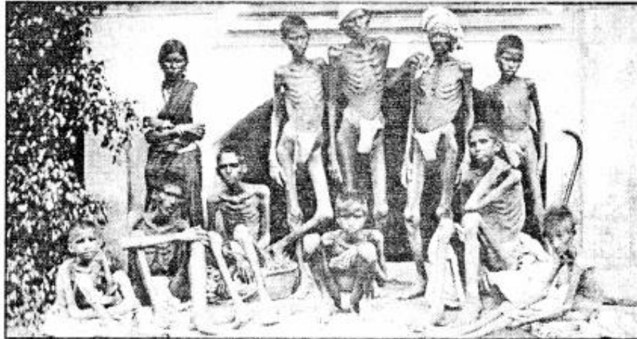
Starvation and malnutrition at its peak. Epidemics kill thousands of people.