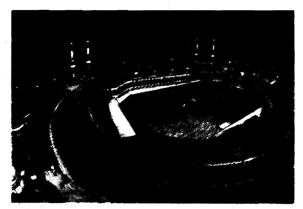
Kaaba, the famous pilgrimmage centre of the Muslims.