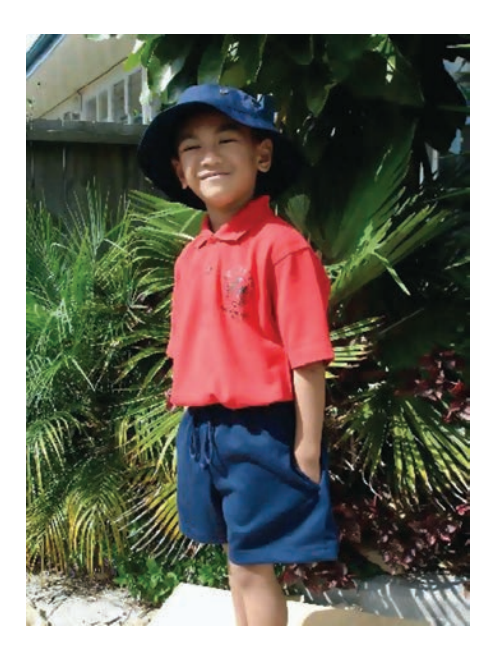
A Class VII Samoan child in his school uniform.

From Class VI onwards, boys and girls went to separate schools. The girls' school was designed very differently from the boys' school. They had a central courtyard where they played in total seclusion and