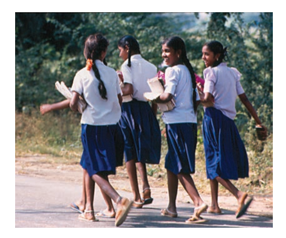
Why do girls like to go to school together in groups?

In what ways do the experiences of Samoan children and teenagers differ from your own experiences of growing up? Is there anything in this experience that you wish was part of your growing up?