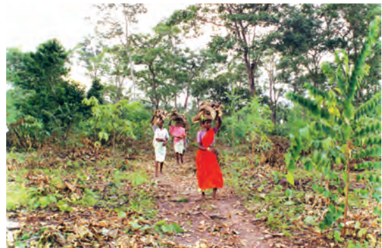
Fig.6 - Women returning home after collecting fuelwood.