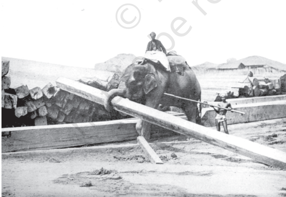
Fig.5 – Elephants piling squares of timber at a timber yard in Rangoon. In the colonial period elephants were frequently used to lift heavy timber both in the forests and at the timber yards.