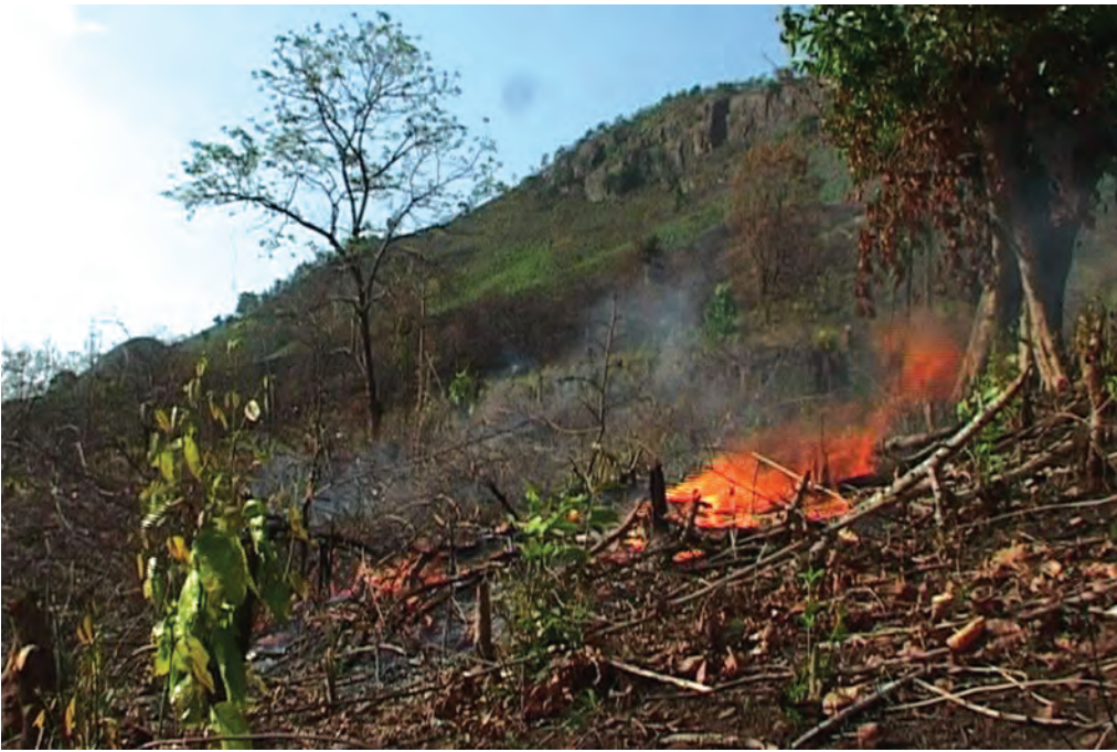
Fig. 16 – Burning the forest penda or podu plot.

In shifting cultivation, a clearing is made in the forest, usually on the slopes of hills. After the trees have been cut, they are burnt to provide ashes. The seeds are then scattered in the area, and left to be irrigated by the rain.