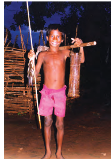
Fig. 17 – The little fisherman.

While the forest laws deprived people of their customary rights to hunt, hunting of big game became a sport. In India, hunting of tigers and other animals had been part of the culture of the court and nobility for centuries. Many Mughal paintings show princes and emperors enjoying a hunt. But under colonial rule the scale of hunting increased to such an extent that various species became almost extinct. The British saw large animals as signs of a wild, primitive and savage society. They believed that by killing dangerous animals the British