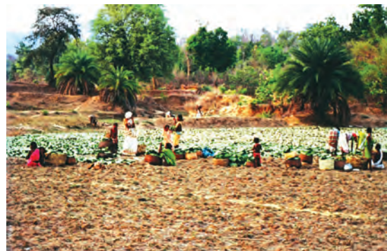
Fig. 13 – Drying tendu leaves.

The Forest Act meant severe hardship for villagers across the country. After the Act, all their everyday practices – cutting wood for their