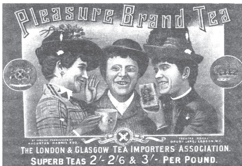
Fig.8 – Pleasure Brand Tea.

Large areas of natural forests were also cleared to make way for tea, coffee and rubber plantations to meet Europe's growing need for these commodities. The colonial government took over the forests, and gave vast areas to European planters at cheap rates. These areas were enclosed and cleared of forests, and planted with tea or coffee.