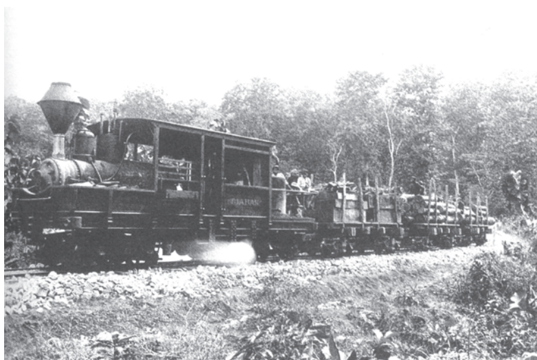
Fig.21 – Train transporting teak out of the forest – late colonial period.

As in India, the need to manage forests for shipbuilding and railways led to the