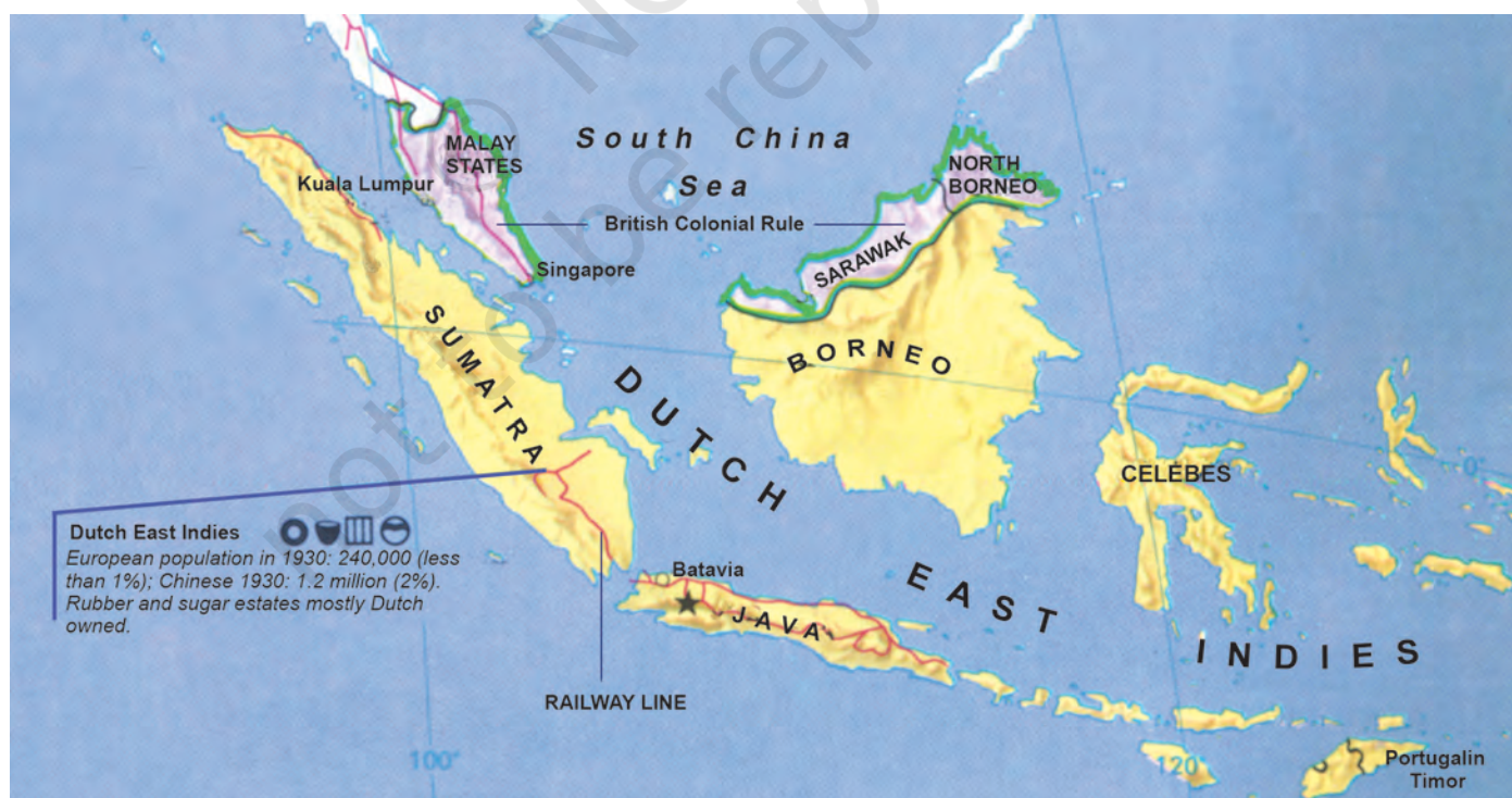
Fig. 22 – Most of Indonesia's forests are located in islands like Sumatra, Kalimantan and West Irian. However, Java is where the Dutch began their 'scientific forestry'. The island, which is now famous for rice production, was once richly covered with teak.

Dirk van Hogendorp, cited in Peluso, Rich Forests, Poor People , 1992.