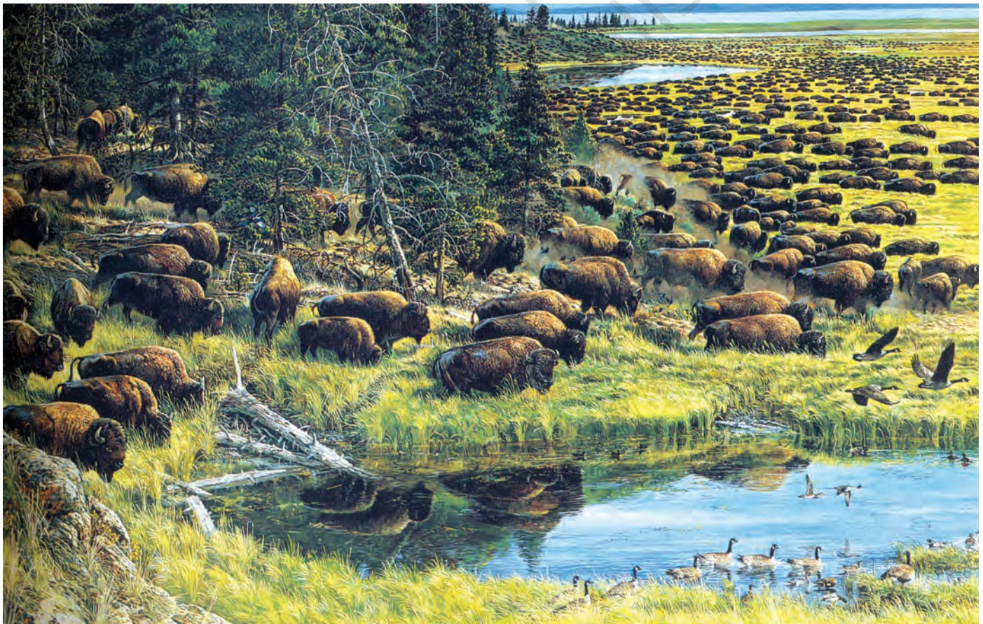
Fig.2 – When the valleys were full. Painting by John Dawson. Native Americans like the Lakota tribe who lived in the Great North American Plains had a diversified economy. They cultivated maize, foraged for wild plants and hunted bison. Keeping vast areas open for the bison to range in was seen by the English settlers as wasteful. After the 1860s the bisons were killed in large numbers.

In 1600, approximately one-sixth of India's landmass was under cultivation. Now that figure has gone up to about half. As population increased over the centuries and the demand for food went up, peasants extended the boundaries of cultivation, clearing forests and breaking new land. In the colonial period, cultivation expanded rapidly for a variety of reasons. First, the British directly encouraged