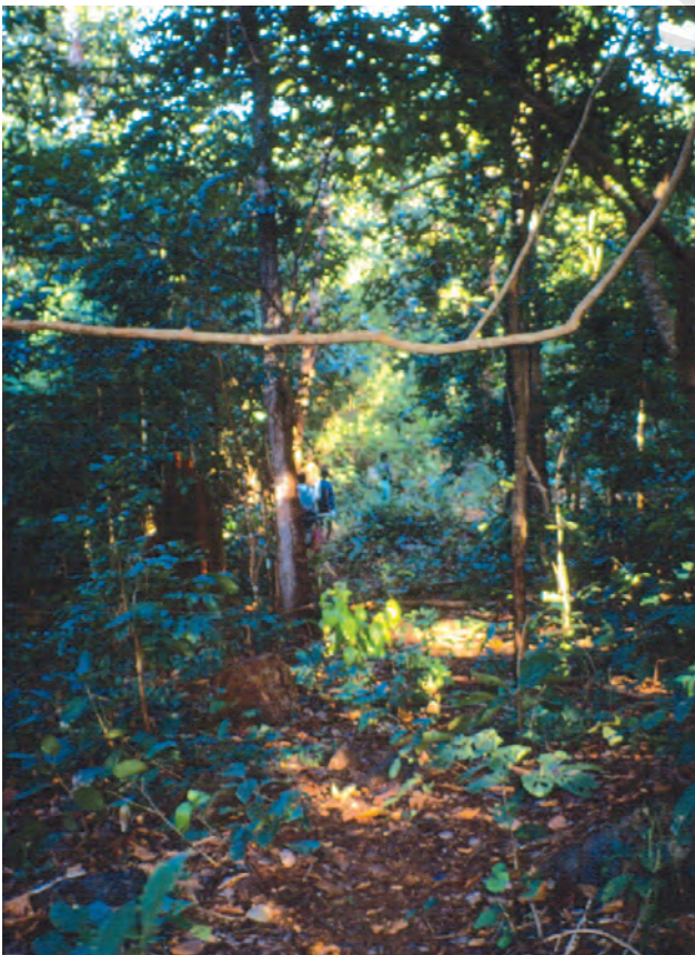
Fig. 1 – A sal forest in Chhattisgarh.

A lot of this diversity is fast disappearing. Between 1700 and 1995, the period of industrialisation, 13.9 million sq km of forest or 9.3 per cent of the world's total area was cleared for industrial uses, cultivation, pastures and fuelwood.