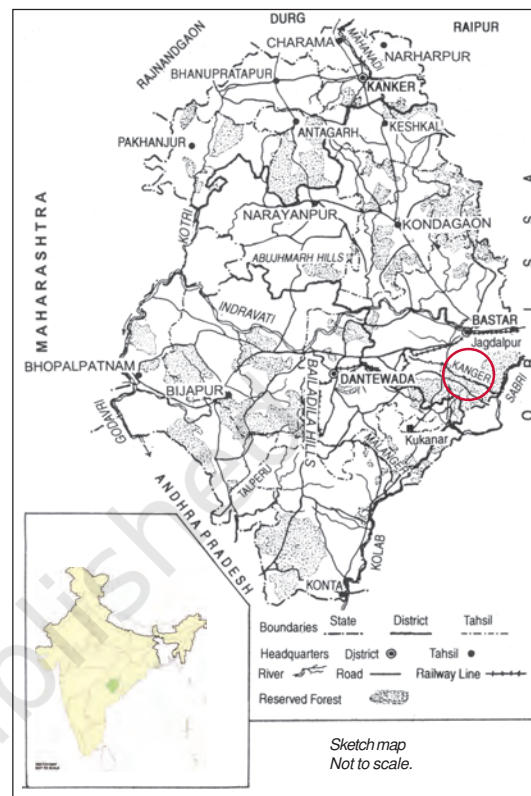
Fig. 20 – Bastar in 2000.

This photograph of an army camp was taken in Bastar in 1910. The army moved with tents, cooks and soldiers. Here a sepoy is guarding the camp against rebels.