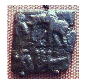
Mauryan cast copper coin dating back to late 3<sup>rd</sup> century BC