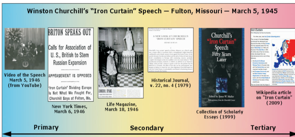
Figure 1: Flow from primary to secondary and tertiary resources: A time line

As an introduction, examine the image given below (Figure 1), where three manifestations of the same event are represented as three sources of information: primary, secondary and tertiary.