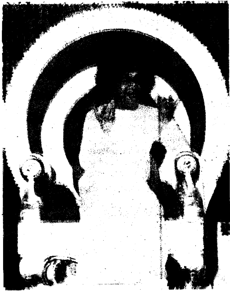
Satya Sai Baba is a most famous deity saint in contemporary Hinduism.

In Hinduism there has always been a tradition of tolerance and hospitality to other religions. These elements of tolerance and hospitality have paved the way to declare India a secular state. It is significant that in the nineteenth century there were the revivalist tendencies and attempts in Hinduism advocating a return to the Vedas and occasionally Indian nationalism was expressed itself in the Hindu idiom. However,