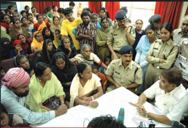
Gas victims with the Gas Relief Minister

Despite the overwhelming evidence pointing to UC as responsible for the disaster, it refused to accept responsibility.