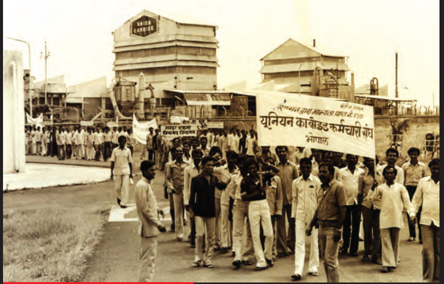
Members of UC Employees Union protesting

The disaster was not an accident. UC had deliberately ignored the essential safety measures in order to cut costs. Much before the Bhopal disaster, there had been incidents of gas leak killing a worker and injuring several.