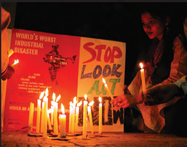
The struggle for justice goes on...

24 years later, people are still fighting for justice: for safe drinking water, for health-care facilities and jobs for the people poisoned by UC. They also demand that Anderson, the UC chairman who faces criminal charges, be prosecuted.