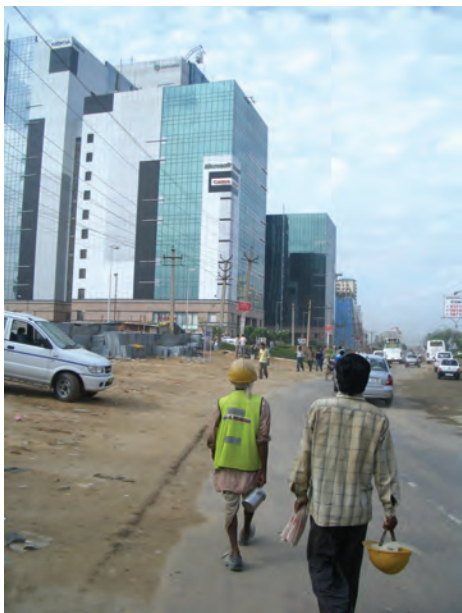
Accidents are common to construction sites. Yet, very often, safety equipment and other precautions are ignored.