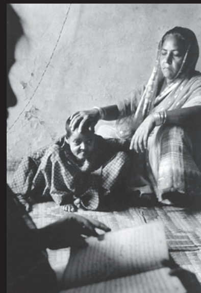
A child severely affected by the gas

Most of those exposed to the poison gas came from poor, working-class families, of which nearly 50,000 people are today too sick to work. Among those who survived, many developed severe respiratory disorders, eye problems and other disorders. Children developed peculiar abnormalities, like the girl in the photo.