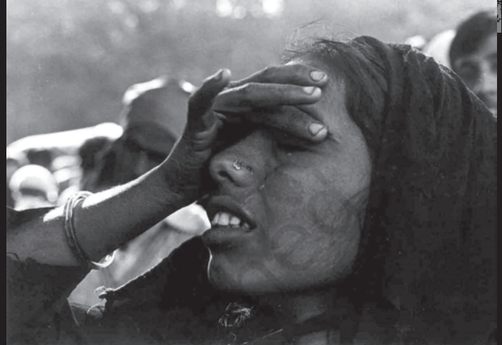
The next morning