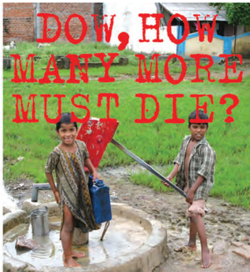
Pumps at contaminated wells are painted red by the government around the UC factory in Bhopal. Yet, local people continue to use them as they have no other accessible source of clean water.