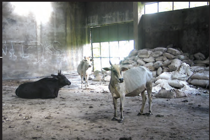
Bags of chemicals lie strewn around the UC plant

UC stopped its operations, but left behind tons of toxic chemicals. These have seeped into the ground, contaminating water. Dow Chemical, the company who now owns the plant, refuses to take responsibility for clean up.