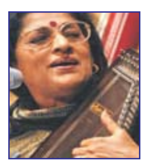
Kishori Amonkar [ 1]