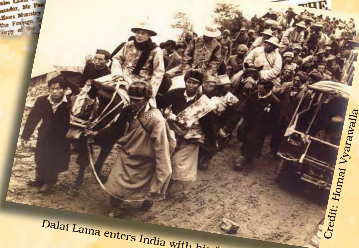
Dalai Lama enters India with his followers.

China has created the Tibet autonomous region, which is an integral part of China. Tibetans oppose the Chinese claim that Tibet is part of Chinese territory. They also oppose the policy of bringing into Tibet more and more Chinese settlers. Tibetans dispute China's claim that autonomy is granted to the region. They think that China wants to undermine the traditional religion and culture of Tibet.