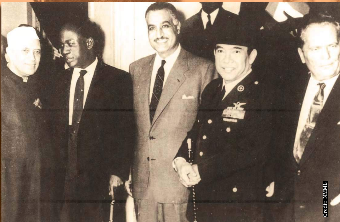
Nehru with Nkrumah from Ghana, Nasser from Egypt, Sukarno from Indonesia and Tito from Yugoslavia at a meeting of non-aligned nations, New York, October 1960. These five comprised the core leadership of the Non-Aligned Movement (NAM).