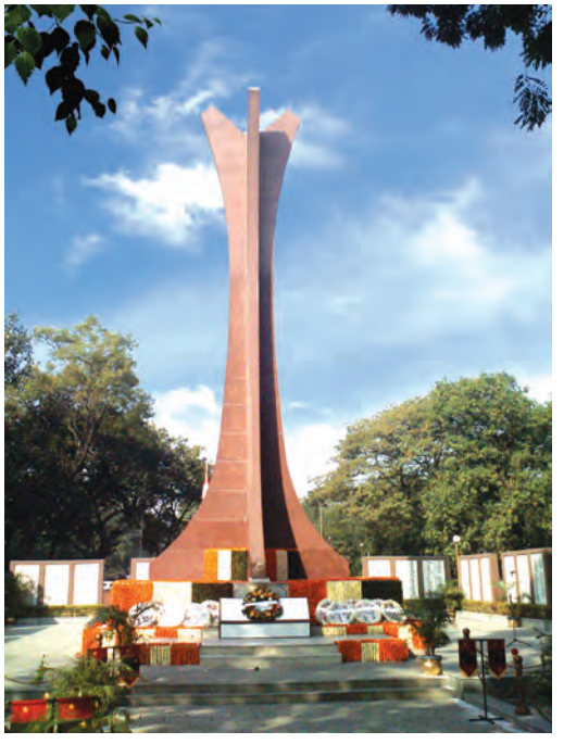
First World War - War Memorial at Pune

World War I left significant impact on various fields including production of war supplies, civil industries, trade, economic policies. sea and land transportation, farming and agricultural production, fuel supply, defence systems, etc. This war boosted India's industrial growth. The direct and indirect impacts of the war were more evident in fields like iron industry, steel industry, coal and mining industries. After the war was over, there was considerable growth in motor transportation and the number of motor vehicles. During war times and post-war period there was decrease in the export amounting to a loss of Rs.33 approximately. The crores. prices of agricultural products reduced but the prices of industrial products increased. Indian food grains were exported to England and allied nations. It caused a shortage of food grains for the Indians. Prices of food grains in Indian markets began to rise.