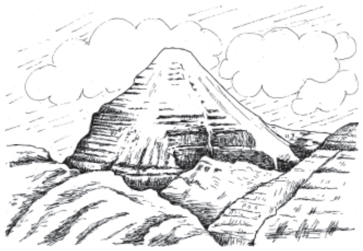
Sketch of Mount Kailash

that would look up from nibbling the arid pastures and frown before bounding away into the void. Further on, where the plains became more stony than grassy, a great herd of wild ass came into view. Tsetan told us we were approaching them long before they appeared. " Kyang ," he said, pointing towards a far-off pall of dust. When we drew near, I could see the herd galloping en masse, wheeling and turning in tight formation as if they were practising manoeuvres on some predetermined course. Plumes of dust billowed into the crisp, clean air.