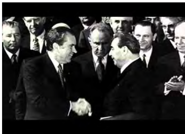
US President Richard Nixon and General Secretary of the Communist Party of the Soviet Union Leonid Brezhnev met at Moscow (1972)

Richard Nixon and General Secretary of the Communist Party of the Soviet Union Leonid Brezhnev met at Moscow. This meeting was significant as it began the process of reduction of tensions. An important agreement was signed to limit the nuclear missiles that the two countries had. The 1972 Moscow summit meeting signaled the beginning of the era of détente. Détente means reduction of tensions. The United States and the Soviet Union tried to reduce tensions between themselves.