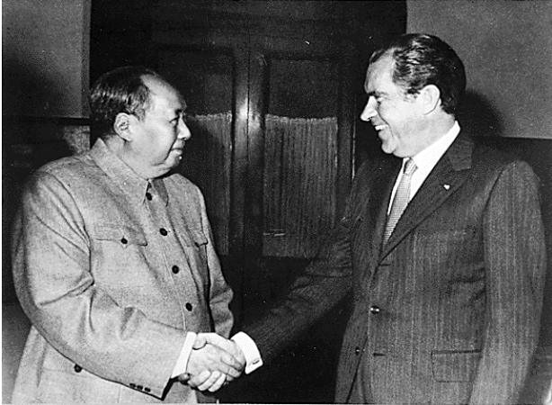
Chairman Mao Zedong and US President Richard Nixon (1972)

1949. President Richard Nixon visited China in 1972. Now, by visiting China in 1972, the United States had recognised the communist government of China. This was the first visit by an American President to China after China had become communist.