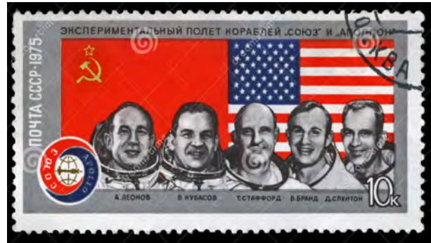
Postage Stamp celebrating the Apollo-Soyuz joint flight

President Jimmy Carter, Egyptian President Anwar el-Sadat and Israeli Prime Minister Menachem Begin signed a 'Framework for Peace for Middle East'. This meeting tried to reduce tensions between Israel and the Arab world.