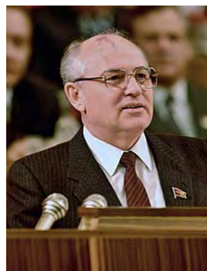
Mikhail Gorbachev : General Secretary of the Communist Party of the Soviet Union and President of USSR

The impact of Gorbachev's new policies was felt in the domestic politics of the country. People were given the freedom to criticise the government's