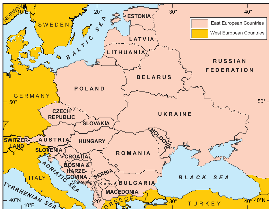
East Europe today

Please see the following websites for further information: