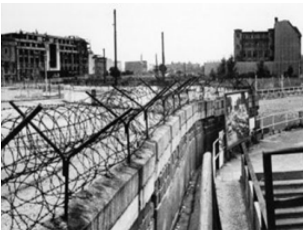
Picture of the Berlin Wall

In 1962 came the Cuban Missile Crisis. This was one of the most significant events of the cold war. Soviet Union placed missiles in Cuba that were a direct threat to the United States. Americans retaliated with a naval blockade of Cuba. This was the first direct confrontation between the cold war rivals. For the first time since 1945 American and Soviet naval ships faced each other and there was a real possibility of a war. It was feared that such a war would be a nuclear war. This forced the two countries to reduce tensions. The situation was de-escalated after the Soviets withdrew the missiles from Cuba.