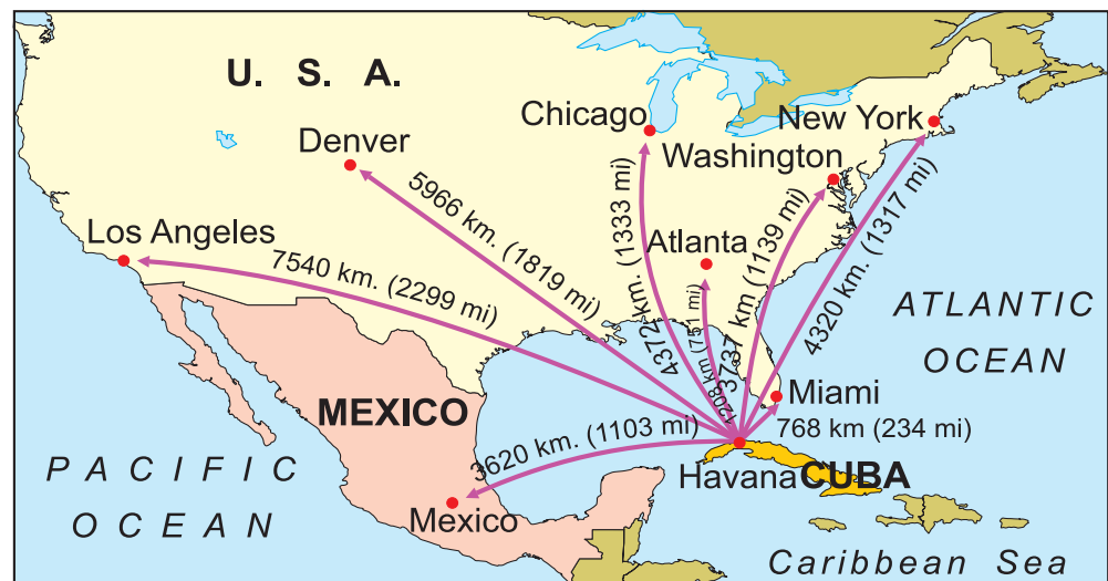
Location of Cuba vis a vis United States

The Camp David Summit began a new era in cold war. The meeting had sought to create goodwill between the two cold war adversaries. However tensions between the United States and the Soviet Union continued to escalate. In 1961 the Soviets started to erect the Berlin Wall. This wall virtually cut off the city of West Berlin from the rest of the country. People could not travel between East and West Berlin. Families and friends were cut off from each other.