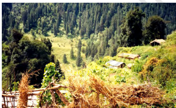
Figure 16.2 A view of a forest life

Do you think such use of forest resources would lead to the exhaustion of these resources? Do not forget that before the British came and took over most of our forest areas, people had been living in these forests for centuries. They had developed practices to ensure that the resources were used in a sustainable manner. After the British took control of the forests (which they exploited ruthlessly for their own purposes), these people were forced to depend on much smaller areas and forest resources started becoming over-exploited to some extent. The Forest Department in independent India took over from the British but local knowledge and local needs continued to be ignored in the management practices. Thus vast tracts of forests have been converted to monocultures of pine, teak or eucalyptus. In order to plant these trees, huge areas are first cleared of all vegetation. This destroys a large amount of biodiversity in the area. Not only this, the varied needs of the local people – leaves for fodder, herbs for medicines, fruits and nuts for food – can no longer be met from such forests. Such plantations are useful for the industries to access specific products and are an important source of revenue for the Forest Department.