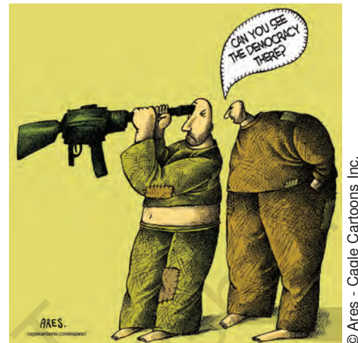
Seeing the democracy