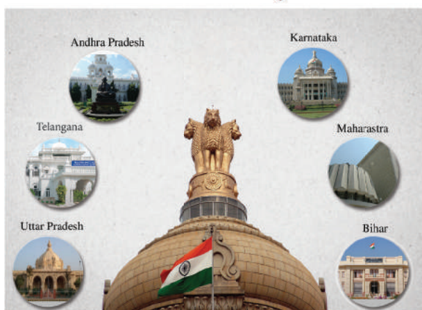
states with bicameral legislature

In India, the State Legislature consists of the Governor and one or two houses. The upper house is called the Legislative Council while the lower house is called the Legislative Assembly.