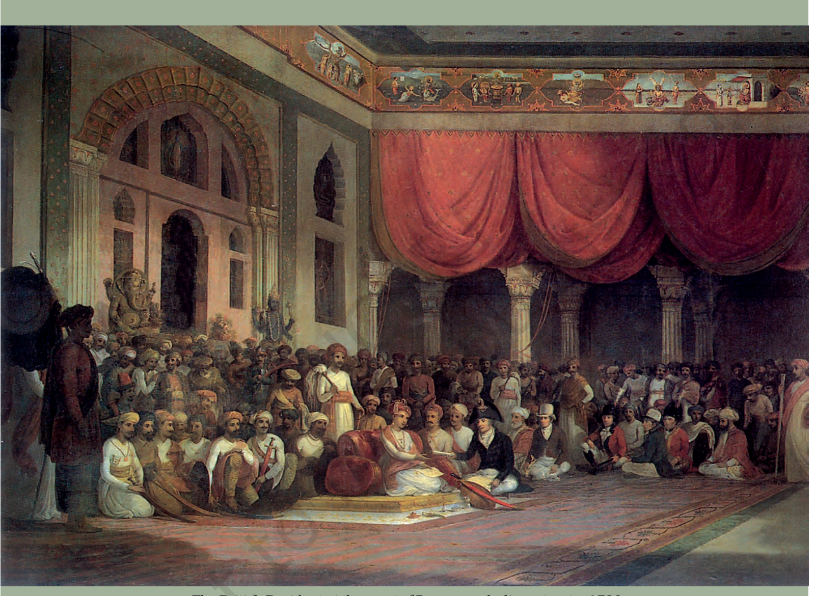
The British Resident at the court of Poona concluding a treaty, 1790