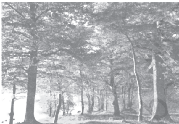
Figure 5.3 : Deciduous Forests

These are the most widespread forests in India. They are also called the monsoon forests. They spread over regions which receive rainfall between 70-200 cm. On the basis of the availability of water, these forests are further divided into moist and dry deciduous.