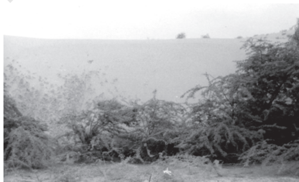
Figure 5.4 : Tropical Thorn Forests

Tropical thorn forests occur in the areas which receive rainfall less than 50 cm. These consist of a variety of grasses and shrubs. It includes semi-arid areas of south west Punjab, Haryana, Rajasthan, Gujarat, Madhya Pradesh and Uttar Pradesh. In these forests, plants remain leafless for most part of the year and give an expression of scrub vegetation. Important species found are babool, ber , and wild date palm, khair, neem, khejri, palas , etc. Tussocky grass grows upto a height of 2 m as the under growth.