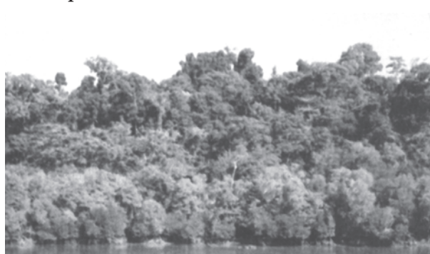
Figure 5.1 : Evergreen Forest

The semi evergreen forests are found in the less rainy parts of these regions. Such forests have a mixture of evergreen and moist deciduous trees. The undergrowing climbers provide an evergreen character to these forests. Main species are white cedar, hollock and kail.