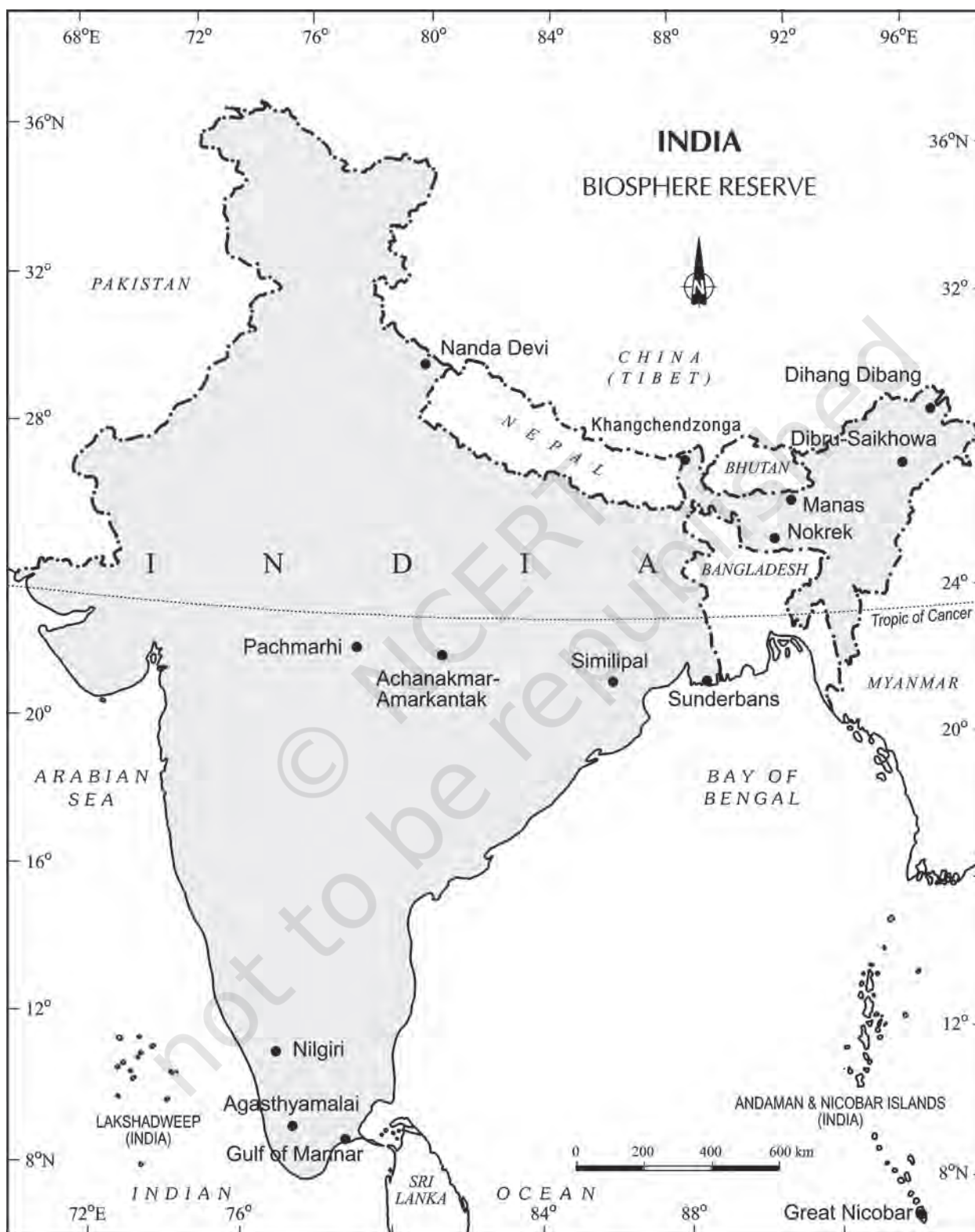
Figure 5.9 : India : Biosphere Reserves