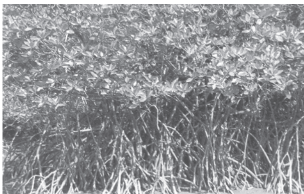
Figure 5.6 : Mangrove Forests

They consist of a number of salt-tolerant species of plants. Crisscrossed by creeks of stagnant water and tidal flows, these forests give shelter to a wide variety of birds.