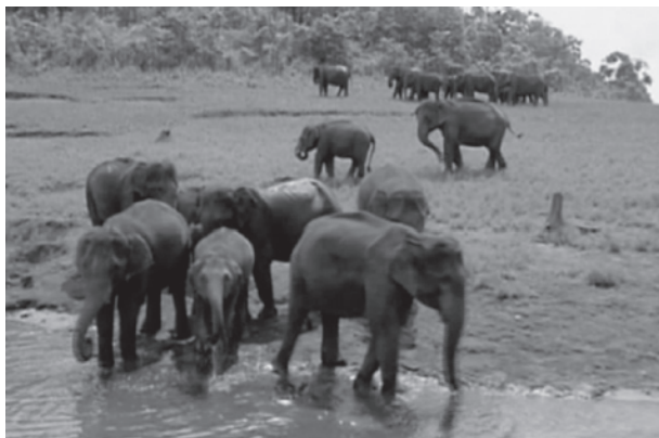
Figure 5.7 : Elephants in their Natural Habitat