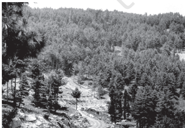
Figure 5.5 : Montane Forests

The Himalayan ranges show a succession of vegetation from the tropical to the tundra, which change in with the altitude. Deciduous forests are found in the foothills of the Himalayas. It is succeeded by the wet temperate type of forests between an altitude of 1,000-2,000 m. In the higher hill ranges of northeastern India, hilly areas of West Bengal and Uttaranchal, evergreen broad leaf trees such as oak and chestnut are predominant. Between 1,500-1,750 m, pine forests are also well-developed in this zone, with Chir Pine as a very useful commercial tree. Deodar, a highly valued endemic species grows mainly in the western part of the Himalayan range. Deodar is a durable wood mainly used in construction activity. Similarly, the chinar and the walnut, which sustain the famous Kashmir handicrafts, belong to this zone. Blue pine and spruce appear at altitudes of 2,225-3,048 m. At many places in this zone, temperate grasslands are also found. But in the higher reaches there is a transition to Alpine forests and pastures. Silver firs, junipers, pines, birch and rhododendrons, etc. occur between 3,000-4,000 m. However, these pastures are used extensively for transhumance by tribes like the Gujjars, the Bakarwals, the Bhotiyas and the Gaddis. The southern slopes of the Himalayas carry a thicker vegetation cover because of relatively higher precipitation than the drier north-facing slopes. At higher altitudes, mosses and lichens form part of the tundra vegetation.