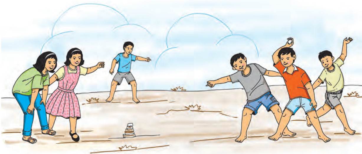
Children at play

Animals learn only a certain number of skills in their life. In comparison, human beings go on learning many more things throughout their life.