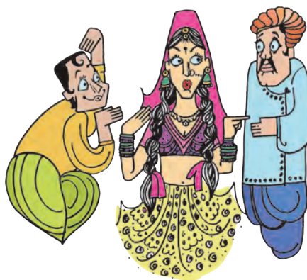
The Potter, The Money-lender's Daughter and The Goldsmith

Money-lender : (in a desperate voice) O Just King ! Spare my daughter. She is my only child and to be wedded next Monday.