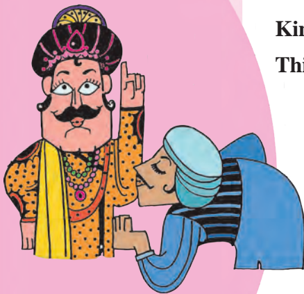
King Chaupat and the Thief