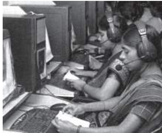
A Call Centre

Nike grew enormously from its inception in the 1960s. Nike grew as an importer of shoes. The founder Phil Knight imported shoes from Japan and sold them at athletics meetings. The company grew to a multinational enterprise, a transnational corporation. Its headquarters are in Beaverton, just outside Portland, Oregon. Only two US factories ever made shoes for Nike. In the 1960s they were made in Japan. As costs increased production shifted to South Korea in mid-1970s. Labour costs grew in South Korea, so in the 1980s production widened to Thailand and Indonesia. In the 1990s we in India produce Nike. However, if labour is cheaper elsewhere production centres will move somewhere else. This entire process makes the labouring population very vulnerable and insecure. This flexibility of labour often works in favour of the producers. Instead of mass production of goods at a centralised location (Fordism), we have moved to a system of flexible production at dispersed locations (post-Fordism).