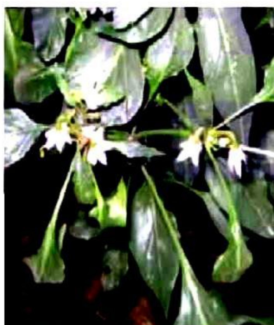
Raat ki rani