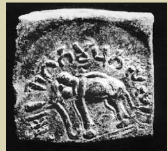
A Satavahana coin

There were other changes that were taking place, in which ordinary men and women played a major role. These included the spread of agriculture and the growth of new towns, craft production and trade. Traders explored land routes within the subcontinent and outside, and sea routes to West Asia, East Africa and South East Asia (see Map 6) were also opened up. And many new buildings were built — including the earliest temples and stupas, books were written, and scientific discoveries were made. These developments took place simultaneously, i.e. at the same time. Keep this in mind as you read the rest of the book.