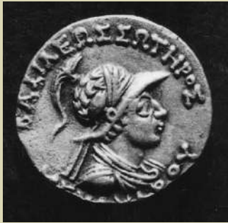
An Indo-Greek coin

The Mauryan empire collapsed about 2200 years ago. In its place (and elsewhere) rose several new kingdoms. In the north-west, and in parts of north India, kings known as the Indo-Greeks ruled for about one hundred years. They were followed by a Central Asian people known as the Shakas, who set up kingdoms in the north-west, north and western India. Some of these kingdoms lasted for about 500 years, till the Shakas were defeated by the Gupta kings (Chapter 10). The Shakas in turn were followed by the Kushanas (about 2000 years ago). You will learn more about the Kushanas in Chapter 9.