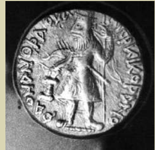
A Kushana coin

The Shakas who ruled over parts of western India fought several battles with the Satavahanas, who ruled over western and parts of central India. The Satavahana kingdom, which was established about 2100 years ago, lasted for about 400 years. Around 1700 years ago, a new ruling family, known as the Vakatakas, became powerful in central and western India.