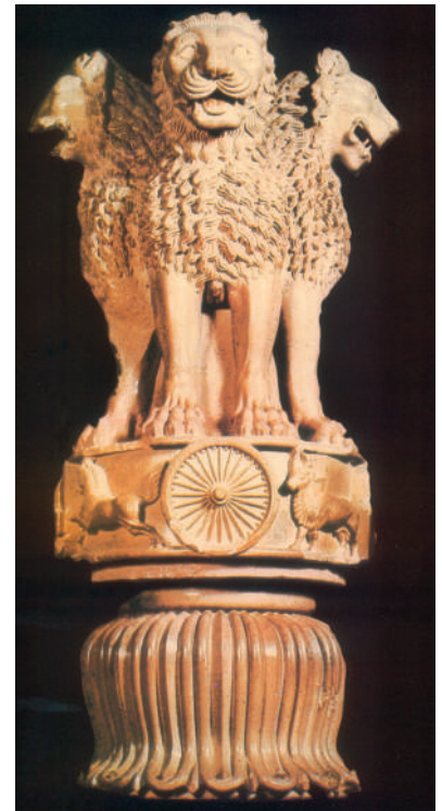
The lion capital

The empire that Ashoka ruled was founded by his grandfather, Chandragupta Maurya, more than 2300 years ago. Chandragupta was supported by a wise man named Chanakya or Kautilya. Many of Chanakya's ideas were written down in a book called the Arthashastra.