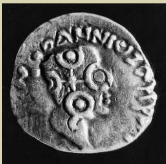
A Shaka coin

In south India, the Cholas, Cheras and Pandyas ruled between 2200 and 1800 years ago. And, about 1500 years ago, there were two large kingdoms, those of the Pallavas and the Chalukyas. There were several other kingdoms and kings as well. We know about them from their coins and inscriptions, as well as from books.