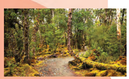
(b) lost in a forest