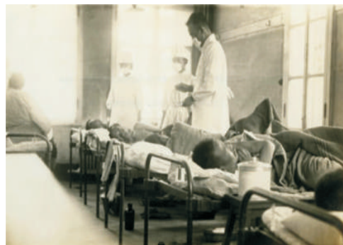
Craiglockhart. October, 1917.

No doubt they'll soon get well; the shock and strain have caused their stammering, disconnected talk. Of course they're 'longing to go out again, '- These boys with old, scared faces, learning to walk. They'll soon forget their haunted nights; their cowed Subjection to the ghosts of friends who died, Their dreams that drip with murder; and they'll be proud Of glorious war that shatter'd all their pride... Men who went out to battle, grim and glad; Children, with eyes that hate you, broken and mad.