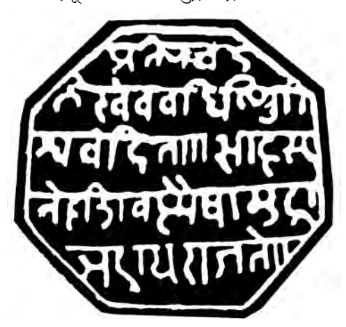
The Royal Seal

प्रतिपच्चंद्रलेखेव वर्धिष्णुर्विश्ववंदिता ।। शाहसूनोः शिवस्यैषा मुद्रा भद्राय राजते ।।