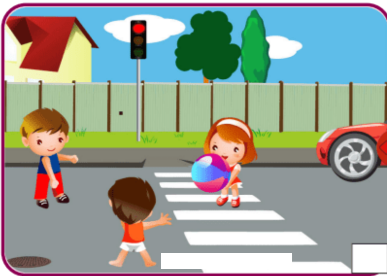
Picture – 6 Playing on the road is dangerous. X