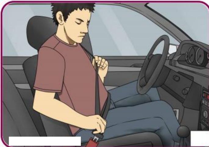
Picture – 4 Putting on the seat belt is correct. ✓