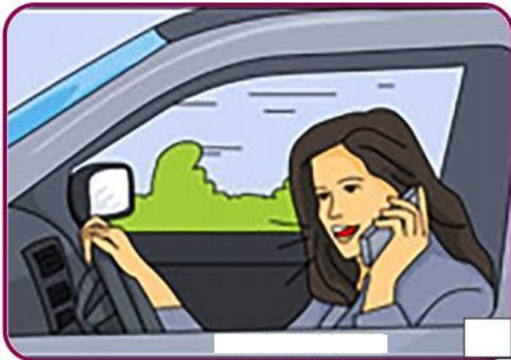
Picture – 3 Talking over the cellphone while driving is dangerous. X