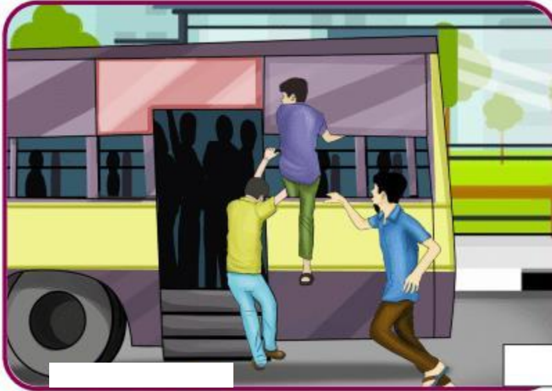
Picture – 5 Standing on the foot board and hanging on the bus is dangerous. X