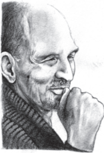
Ingmar Bergman 1918-2007

Ingmar Bergman is a well known Swedish director of films noted for their starkness, their subtle use of black and white and 'shades' of those extremes, the ambiguity of their content, and a certain brooding presence that seems to pervade them all. The list of Bergman films is long; his best known include The Seventh Seal (1957), Wild Strawberries (1958), The Virgin Spring (1960), The Silence (1963), Persona (1967), The Passion of Anna (1970), and Cries and Whispers (1973)—this last film in colour, though emphasising red in all its shadings. In the following selection, the Introduction to Four Screen-plays by Ingmar Bergman (1960), Bergman discusses how he views the art of film-making.