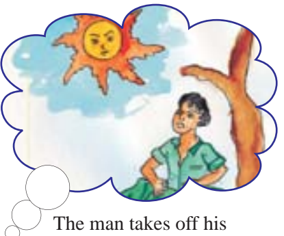
coat and sits under a tree.