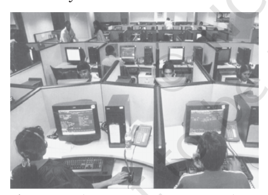
Fig. 3.2 IT industry is seen as a major contributor to India's exports

Some scholars question the usefulness of India being a member of the WTO as a major volume of international trade occurs among the developed nations. They also say that while developed countries file complaints over agricultural subsidies given in their countries, developing countries feel cheated as they are forced to open their markets for developed countries but are not allowed access to the markets of developed countries. What do you think?