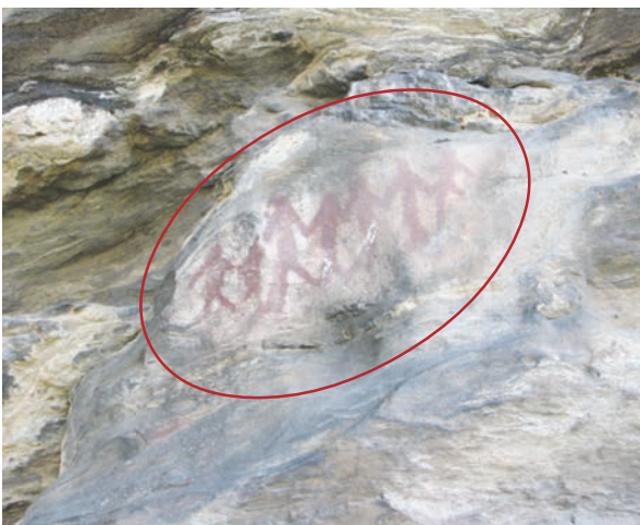
Hand-linked dancing figures, Lakhudiyar, Uttarakhand

Remnants of rock paintings have been found on the walls of the caves situated in several districts of Madhya Pradesh, Uttar Pradesh, Andhra Pradesh, Karnataka and Bihar. Some paintings have been reported from the Kumaon hills in Uttarakhand also. The rock shelters on banks of the River Suyal at Lakhudiyar, about twenty kilometres on the Almora–Barechana road, bear these prehistoric paintings. Lakhudiyar literally means one lakh caves. The paintings here can be divided into three categories: man, animal and geometric patterns in white, black and red ochre. Humans are represented in stick-like forms. A long-snouted animal, a fox and a multiple legged lizard are the main animal motifs. Wavy lines, rectangle-filled geometric designs, and groups of dots can also be seen here. One of the interesting scenes depicted here is of hand-linked dancing human figures. There is some superimposition of paintings. The earliest are in black; over these are red ochre paintings and the last group comprises white paintings. From Kashmir two slabs with engravings have been reported. The granite rocks of Karnataka and Andhra Pradesh provided suitable canvases to the Neolithic man for his paintings. There are several such sites but more famous among them are Kupgallu, Piklihal and Tekkalkota. Three types of paintings have been reported from here—paintings in white, paintings in red ochre over a white background and paintings in red ochre. These