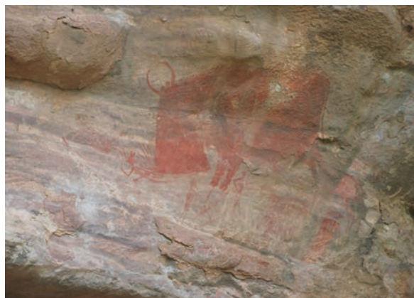
Painting showing a man being hunted by a beast, Bhimbetka

made out of limestone. The rock of mineral was first ground into a powder. This may then have been mixed with water and also with some thick or sticky substance such as animal fat or gum or resin from trees. Brushes were made of plant fibre. What is amazing is that these colours have survived thousands of years of adverse weather conditions. It is believed that the colours have remained intact because of the chemical reaction of the oxide present on the surface of the rocks.