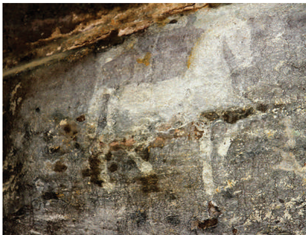
One of the few images showing only one animal, Bhimbetka

The artists of Bhimbetka used many colours, including various shades of white, yellow, orange, red ochre, purple, brown, green and black. But white and red were their favourite colours. The paints were made by grinding various rocks and minerals. They got red from haematite (known as geru in India). The green came from a green variety of a stone called chalcedony. White might have been