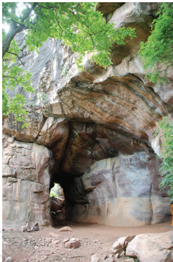
Cave entrance, Bhimbetka, Madhya Pradesh

The paintings of the Upper Palaeolithic phase are linear representations, in green and dark red, of huge animal figures, such as bisons, elephants, tigers, rhinos and boars besides stick-like human figures. A few are wash paintings but mostly they are filled with