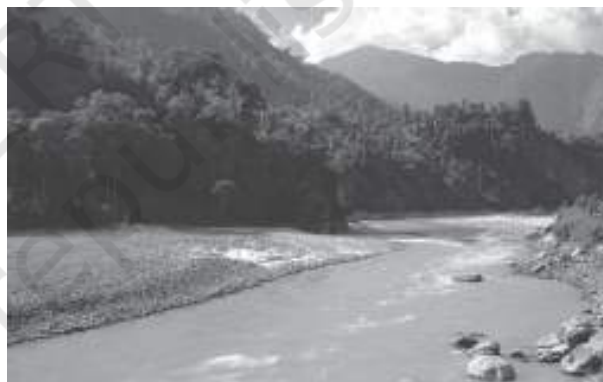
Figure 3.1 : A River in the Mountainous Region

2006) in this class . Can you, then, explain the reason for water flowing from one direction to the other? Why do the rivers originating from the Himalayas in the northern India and the Western Ghat in the southern India flow towards the east and discharge their waters in the Bay of Bengal?