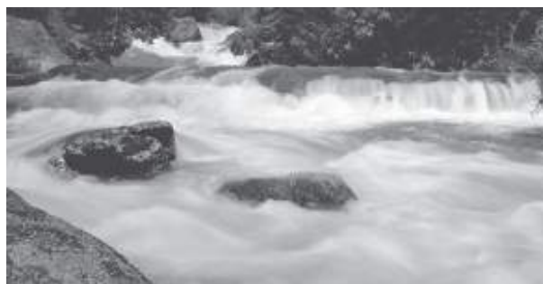
Figure 3.3 : Rapids

The Himalayan drainage system has evolved through a long geological history. It mainly includes the Ganga, the Indus and the Brahmaputra river basins. Since these are fed both by melting of snow and precipitation, rivers of this system are perennial. These rivers pass through the giant gorges carved out by the erosional activity carried on simultaneously with the uplift of the Himalayas. Besides deep gorges, these rivers also form V-shaped valleys, rapids and waterfalls in their mountainous