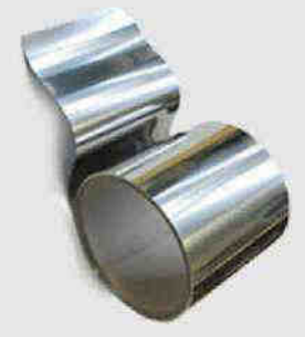
German Silver Sheet