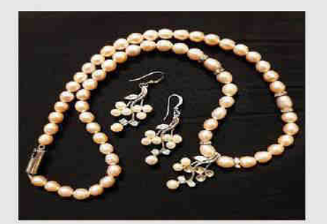
Pearl jewellery from Hyderabad