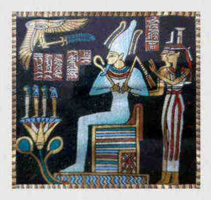
Ancient Egyptian painting depicting use of jewellery

civilizations like the Indus Valley, Egyptian, Roman etc have left behind evidence of the popularity of jewellery from excavations in the form of The Dancing Girl of Mohenjo-daro or from funerary treasures found in the Pyramids of Egypt or ancient Roman art. Each of these civilizations had their own prevalent styles, materials and motifs.