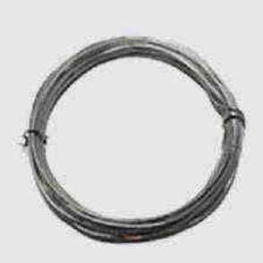
German Silver Wire