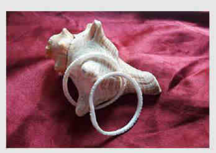
Shaakha bangles from West Bengal