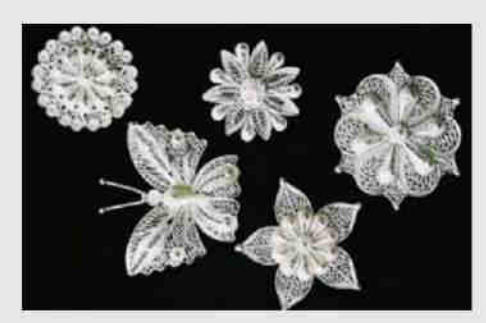
Filigree jewellery from Odisha