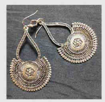
Gun Metal jewellery from Andhra Pradesh