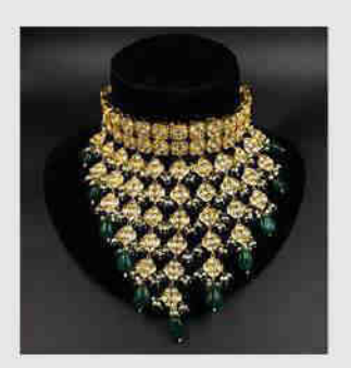
Kundan jewellery from Rajasthan