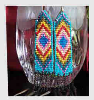
Moti Bharat from Gujarat