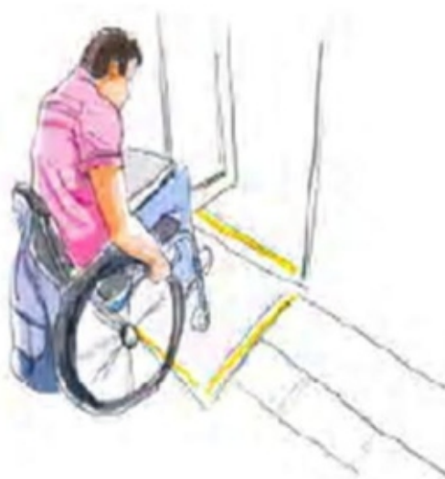
differently abled man using a ramp to board the bus

Development empowers a person to have more economic resources leading to his social mobility and economic solvency. This has resulted in increasing the number of cars on city roads, rash behaviour of drivers. under age super rich kids driving cars and causing fatal accidents, drunken driving etc. Such menace can only be removed by providing strict punishment, setting an example amongst such class.