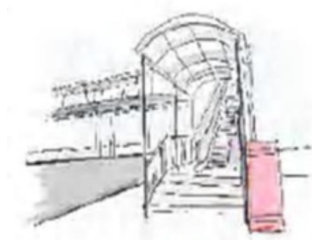
Foot - Over Bridge