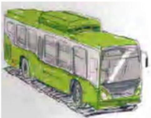
State Transport Service