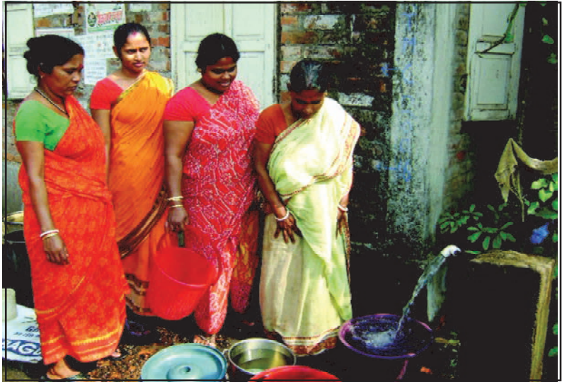
Pic 4.1 Women filling water

When the teacher came to the class, Ramesh asked her, “Madam who is getting the water pipe repaired? Will we have to pay for it?” The teacher replied, “No we will not have to pay for it. This is the work of the municipality. I had informed the municipal member or councillor of our ward. I had told him that as there is no water supply in the school the children are facing much difficulty. The councillor is getting the pipe repaired by the employees of the municipal council.”