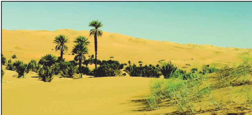
Fig. 9.3: Oasis in the Sahara Desert

snakes and lizards are the prominent animal species living there.