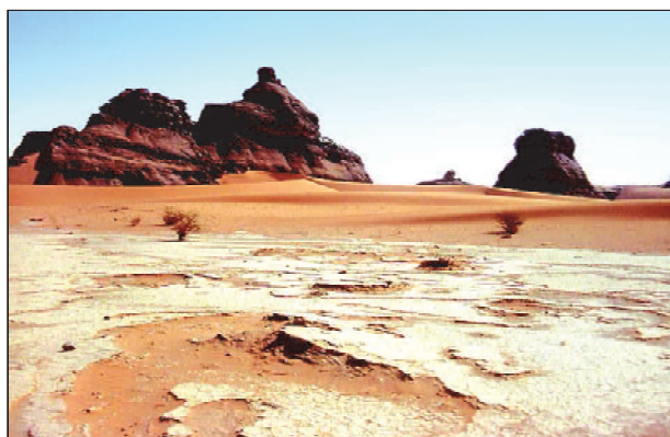
Fig. 9.1: The Sahara Desert

When you think of a desert the picture that immediately comes to your mind is that of sand. But besides the vast stretches of sands, that Sahara desert is covered with, there are also gravel plains and elevated plateaus with bare rocky surface. These rocky surfaces may be more than 2500m high at some places.