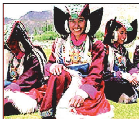
Fig. 9.6: Ladakhi Women in Traditional Dress

Life of people is undergoing change due to modernisation. But the people of Ladakh have over the centuries learned to live in balance and harmony with nature. Due to scarcity of resources like water and fuel, they are used with reverence and care. Nothing is discarded or wasted.