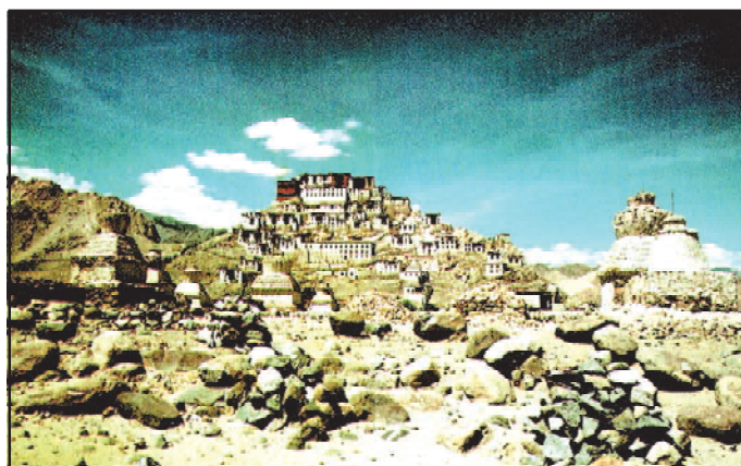
Fig. 9.5: Thiksey Monastery

The finest cricket bats are made from the wood of the willow trees.