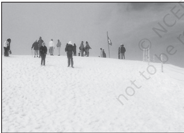
Fig. 7.5: Tourists skiing in the snow capped mountain slopes of Switzerland

Tourism is travel undertaken for purposes of recreation rather than business. It has become the world's single largest tertiary activity in total registered jobs (250 million) and total revenue (40 per cent of the total GDP). Besides, many local persons, are employed to provide services like accommodation, meals, transport, entertainment and special shops serving the tourists. Tourism fosters the growth of infrastructure industries, retail trading, and craft industries (souvenirs). In some regions, tourism is seasonal because the vacation period is dependent on favourable weather conditions, but many regions attract visitors all the year round.