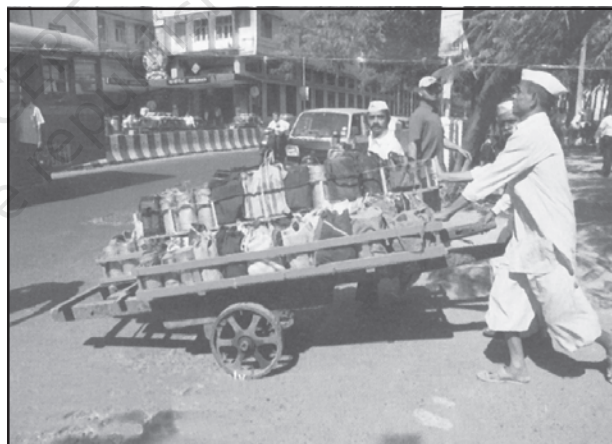
Fig. 7.4: Dabbawala Service in Mumbai

Personal services are made available to the people to facilitate their work in daily life. The workers migrate from rural areas in search of employment and are unskilled. They are employed in domestic services as housekeepers, cooks, and gardeners. This segment of workers is generally unorganised. One such example in India is Mumbai's dabbawala (Tiffin) service provided to about 1,75,000 customers all over the city.