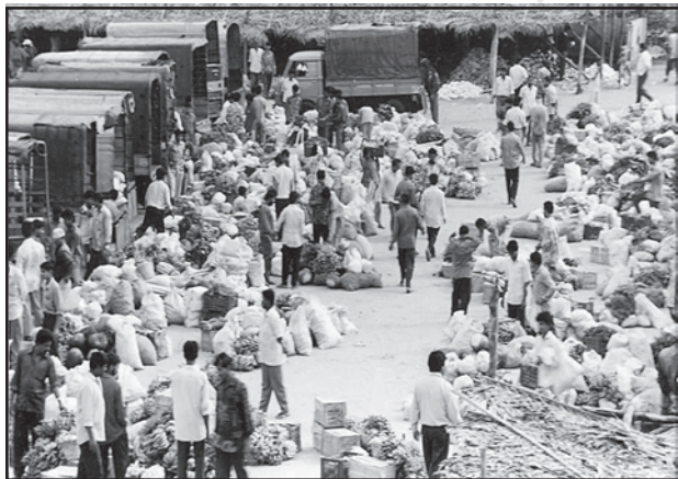
Fig. 7.2: A Wholesale Vegetable Market

Rural marketing centres cater to nearby settlements. These are quasi-urban centres. They serve as trading centres of the most rudimentary type. Here personal and professional services are not well-developed. These form local collecting and distributing centres. Most of these have mandis (wholesale markets) and also retailing areas. They are not urban centres per se but are significant centres for making available goods and services which are most frequently demanded by rural folk.