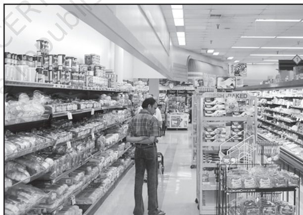
Fig. 7.3: Packed Food Market in U.S.A.

Urban marketing centres have more widely specialised urban services. They provide ordinary goods and services as well as many of the specialised goods and services required by people. Urban centres, therefore, offer manufactured goods as well as many specialised markets develop, e.g. markets for labour, housing, semi or finished products. Services of educational institutions and professionals such as teachers, lawyers, consultants, physicians, dentists and veterinary doctors are available.