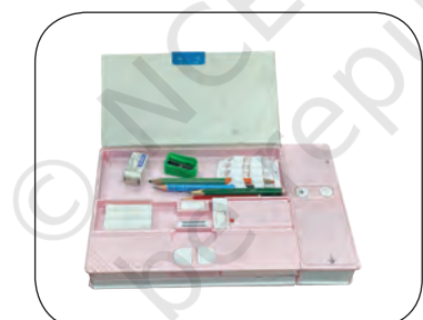
Object — Pencil box