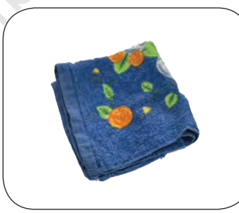
Object — Handkerchief