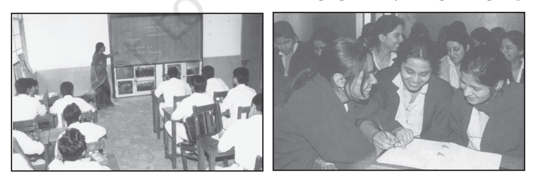
Contrast the two types of groups.

The groups to which we belong are not all of equal importance to us. Some groups tend to influence many aspects of our lives and bring us into personal association with others. The term primary group is used to refer to a small group of people connected by intimate and face-to-face association and co-operation. The members of primary groups have a sense of belonging. Family, village and groups