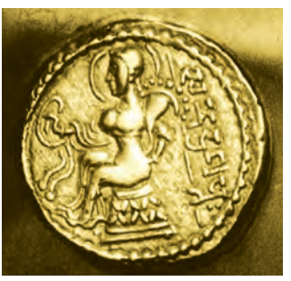
The king who played the veena.

Some other qualities of Samudragupta are shown on coins such as this one, where he is shown playing the veena.