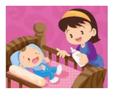
Ans. Circle the adverbs