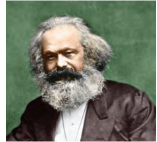
Karl Marx (1818-1883) A German Philosopher

Karl Marx considers the State as an instrument of exploitation of workers. This