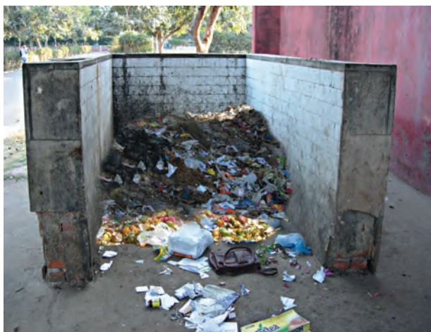
Fig. 16.7 Neighbourhood garbage dump

a few days. In how many days does the bucket become full? You know the number of members in your family. If you find out the population of your city or town, can you now estimate the number of buckets of garbage that may be generated in a day in your city or town? We are generating mountains of garbage everyday, isn't it (Fig. 16.7)?