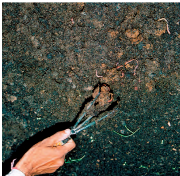
Fig. 16.6 Vermicomposting

Put some wastes as food in one corner of the pit. Most of the worms will shift