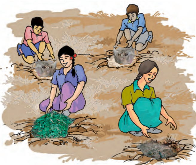
Fig. 16.2 Putting garbage heaps in pits

Now divide the contents of each group into two separate heaps. Label them