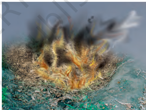
Fig. 16.3 Burning of leaves produce harmful gases

crop plants in their fields after harvesting. Burning of these, produces smoke and gases that are harmful to our health. We should try to stop such practices. These wastes could be converted into useful compost.