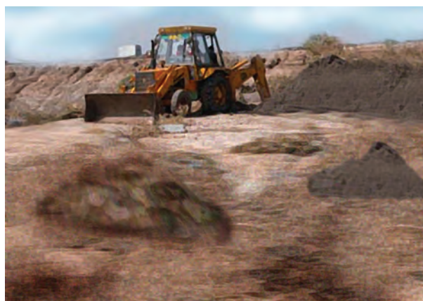
Fig. 16.1 A landfill

There the part of the garbage that can be reused is separated out from the one that cannot be used as such. Thus,