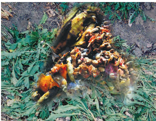
Fig. 16.5 Food for redworms

that may contain salt, pickles, oil, vinegar, meat and milk preparations as food for your redworms. If you put these things in the pit, disease-causing small organisms start growing in the pit. Once in a few days, gently mix and move the top layers of your pit.