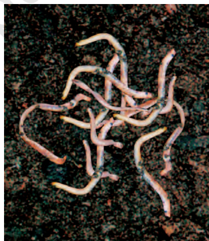
Fig. 16.4 Redworms

Now, your pit is ready to welcome the redworms. Buy some redworms and put them in your pit (Fig. 16.4). Cover them loosely with a gunny bag or an old sheet of cloth or a layer of grass.