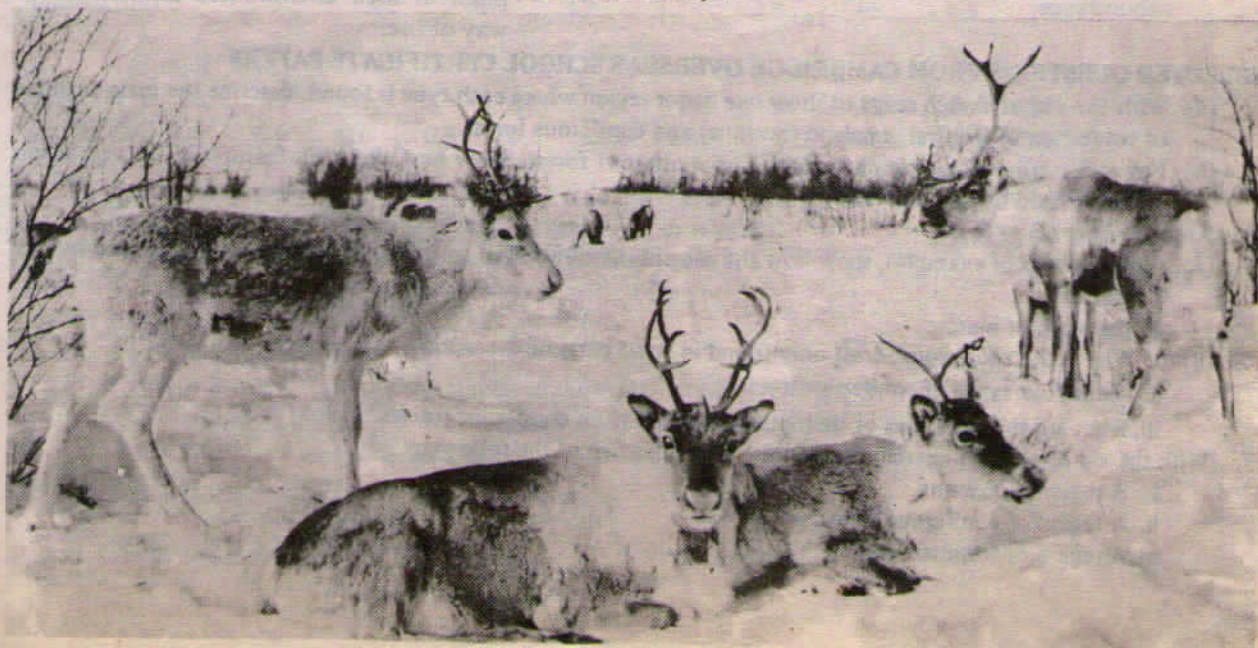
The borderlands between the Taiga and the tundra Elizabeth Meyer

With the establishment of ports on the Arctic seaboard of Eurasia, it is now possible to ship timber and fur from Siberia. Though the ports, such as Igarka at the mouth of the Yenisey, are not ice-free, modern ice-breakers keep the passage open most of the time. On the Arctic lowlands where the growing season is lengthened by warm currents or higher temperatures, experiments have been carried out to devise varieties of hardy cereals for local needs. It may not be long before the tundra is brought under greater agricultural, especially pastoral, use. The healthy air and its preservative qualities (it is practically germ-free) are factors worth consideration for future colonization . Scientists, meteorologists and explorers have lived in the Arctic and Antarctica, making studies of their geology, weather conditions, plant and animal life, that will be of great significance in years to come.