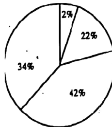
Using Public Transport