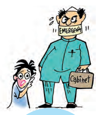
Should the President have declared Emergency without any recommendation from the Cabinet?

There were many acts of dissent and resistance to the Emergency. Many political workers who were not arrested in the first wave, went 'underground' and organised protests against the government. Newspapers like the Indian Express and the Statesman protested against censorship by leaving blank spaces where news items had been censored. Magazines like the Seminar and the Mainstream