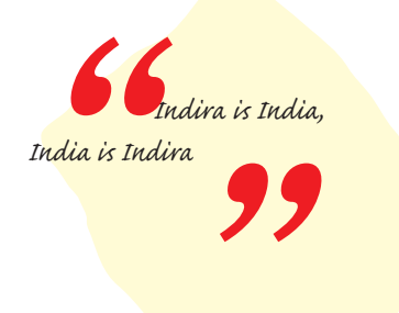
A slogan given by D. K. Barooah, President of the Congress, 1974

remain non-violent and will not limit itself to Bihar. Thus the students' movement assumed a political character and had national appeal. People from all walks of life now entered the movement. Jayaprakash Narayan demanded the dismissal of the Congress government in Bihar and gave a call for total revolution in the social, economic and political spheres in order to establish what he considered to be true democracy. A series of bandhs, gehraos, and strikes