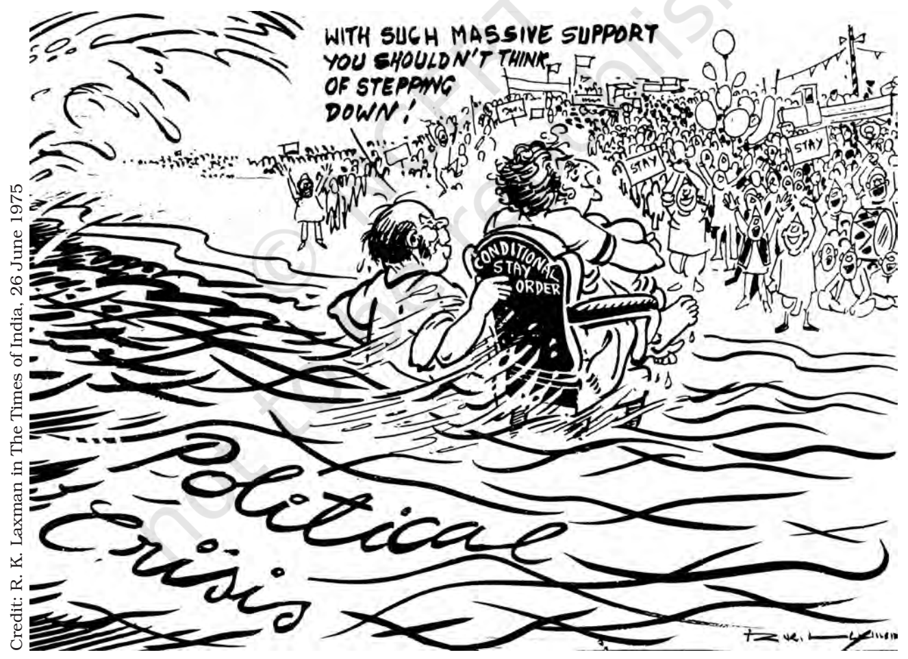
This cartoon appeared few days before the declaration of Emergency and captures the sense of impending political crisis. The man behind the chair is D. K. Barooah, the Congress President.

Once an emergency is proclaimed, the federal distribution of powers remains practically suspended and all the powers are concentrated in the hands of the union government. Secondly, the government also gets the power to curtail or restrict all or any of the Fundamental Rights during the emergency. From the wording of the provisions of the Constitution, it is clear that an Emergency is seen as an