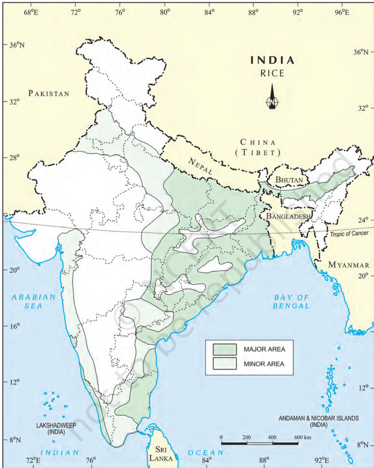
India: Distribution of Rice