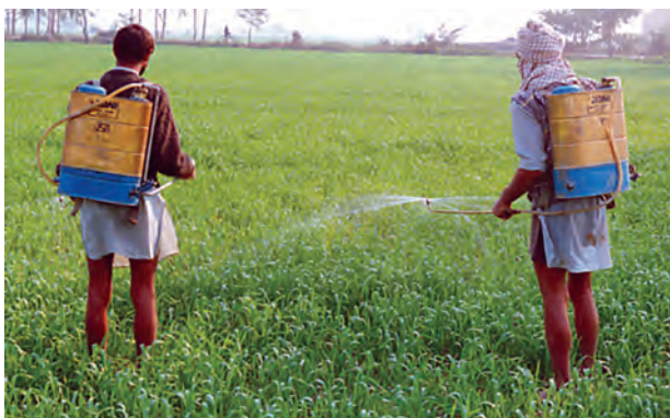
Fig. 4.17 Problems associated with heavy pesticide use are widely recognised in developed and developing countries

A few economists think that Indian farmers have a bleak future if they continue growing foodgrains on the holdings that grow smaller