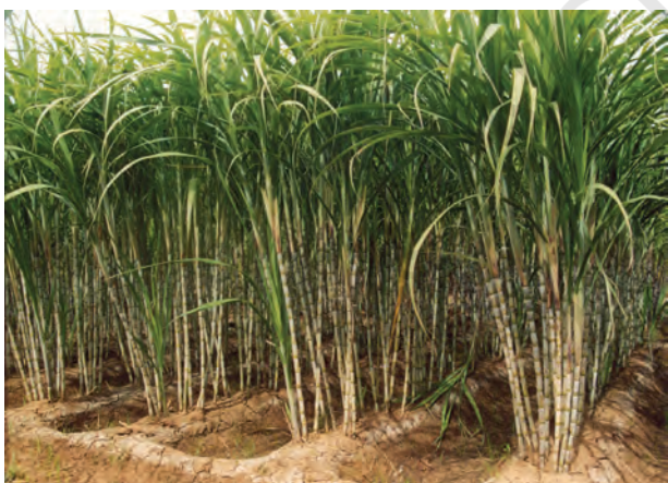
Fig. 4.8: Sugarcane Cultivation

Sugarcane: It is a tropical as well as a subtropical crop. It grows well in hot and humid climate with a temperature of 21 C to 27 C and an annual rainfall between 75cm. and 100cm. Irrigation is required in the regions of low rainfall. It can be grown on a variety of soils and needs manual labour from