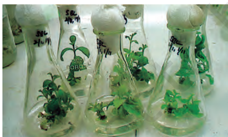
Fig. 4.16: Tissue culture of teak clones

countries because of the highly subsidised agriculture in those countries.