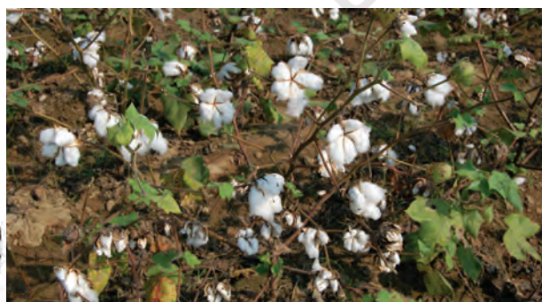
Fig. 4.14: Cotton Cultivation

The laws of land reforms were enacted but the implementation was lacking or lukewarm. The Government of India embarked upon introducing agricultural reforms to improve Indian agriculture in the 1960s and 1970s. The Green Revolution based on the use of package technology and the White Revolution (Operation Flood) were some of the strategies initiated to improve the lot of Indian agriculture. But, this too led to the concentration of development in few selected areas. Therefore, in the 1980s and 1990s, a comprehensive land development programme was initiated, which included both institutional and technical