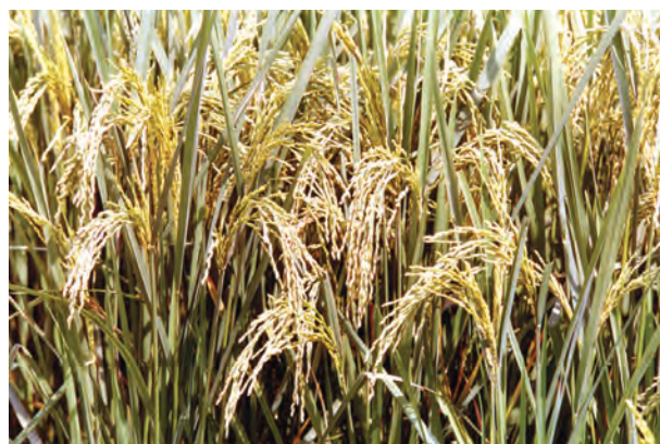
Fig. 4.4 (b): Rice is ready to be harvested in the field