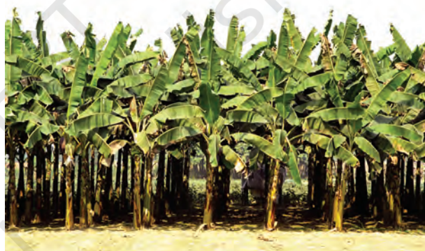
Fig. 4.2: Banana plantation in Southern part of India

In India, tea, coffee, rubber, sugarcane, banana, etc., are important plantation crops. Tea in Assam and North Bengal coffee in Karnataka are some of the important plantation crops grown in these states. Since the production is mainly for market, a well-developed network of transport and communication connecting the plantation areas, processing industries and markets plays an important role in the development of plantations.