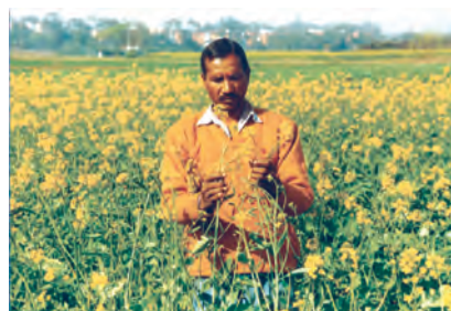
Fig. 4.9: Groundnut, sunflower and mustard are ready to be harvested in the field