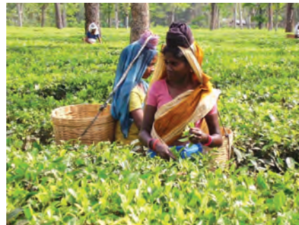
Fig. 4.11: Tea-leaves Harvesting

Horticulture Crops: In 2017, India was the second largest producer of fruits and vegetables in the world after China. India is a producer of tropical as well as temperate fruits. Mangoes of Maharashtra, Andhra Pradesh, Telangana, Uttar Pradesh and West Bengal, oranges of Nagpur and Cherrapunjee (Meghalaya), bananas of Kerala, Mizoram, Maharashtra and Tamil Nadu, lichi and guava of Uttar Pradesh and Bihar, pineapples of Meghalaya, grapes of Andhra Pradesh, Telangana and Maharashtra, apples, pears, apricots and walnuts of Jammu and Kashmir and Himachal Pradesh are in great demand the world over.