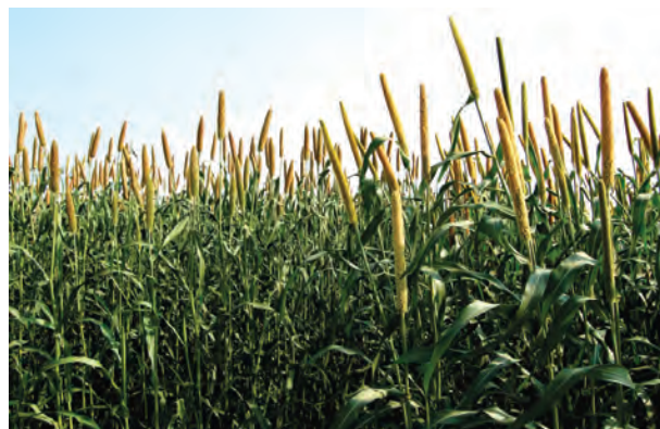
Fig. 4.6: Bajra Cultivation

Bajra grows well on sandy soils and shallow black soil. Major Bajra producing States are Rajasthan, Uttar Pradesh, Maharashtra, Gujarat and Haryana. Ragi is a crop of dry regions and grows well on red, black, sandy, loamy and shallow black soils. Major ragi producing states are: Karnataka, Tamil Nadu, Himachal Pradesh, Uttarakhand, Sikkim, Jharkhand and Arunachal Pradesh.