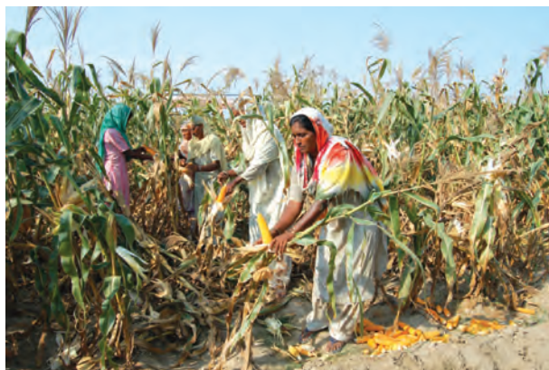
Fig. 4.7: Maize Cultivation

Maize: It is a crop which is used both as food and fodder. It is a kharif crop which requires temperature between 21°C to 27°C and grows well in old alluvial soil. In some states like Bihar maize is grown in rabi season also. Use of modern inputs such as HYV seeds, fertilisers and irrigation have contributed to the increasing production of maize. Major maize-producing states are Karnataka, Madhya Pradesh, Uttar Pradesh, Bihar, Andhra Pradesh and Telangana.