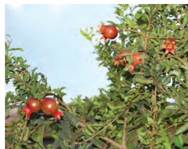
Fig. 4.12: Apricots, apple and pomegranate