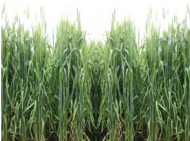
Fig. 4.5: Wheat Cultivation

Wheat: This is the second most important cereal crop. It is the main food crop, in north and north-western part of the country. This rabi crop requires a cool growing season and a bright sunshine at the time of ripening. It requires 50 to 75 cm of annual rainfall evenly-distributed over the growing season. There are two important wheat-growing zones in the country – the Ganga-Satluj plains in the north-west and black soil region of the Deccan. The major wheat-producing states are Punjab, Haryana, Uttar Pradesh, Madhya Pradesh, Bihar and Rajasthan.