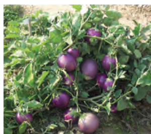
Fig. 4.13: Cultivation of vegetables – peas, cauliflower, tomato and brinjal