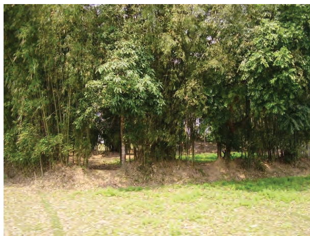
Fig. 4.3: Bamboo plantation in North-east