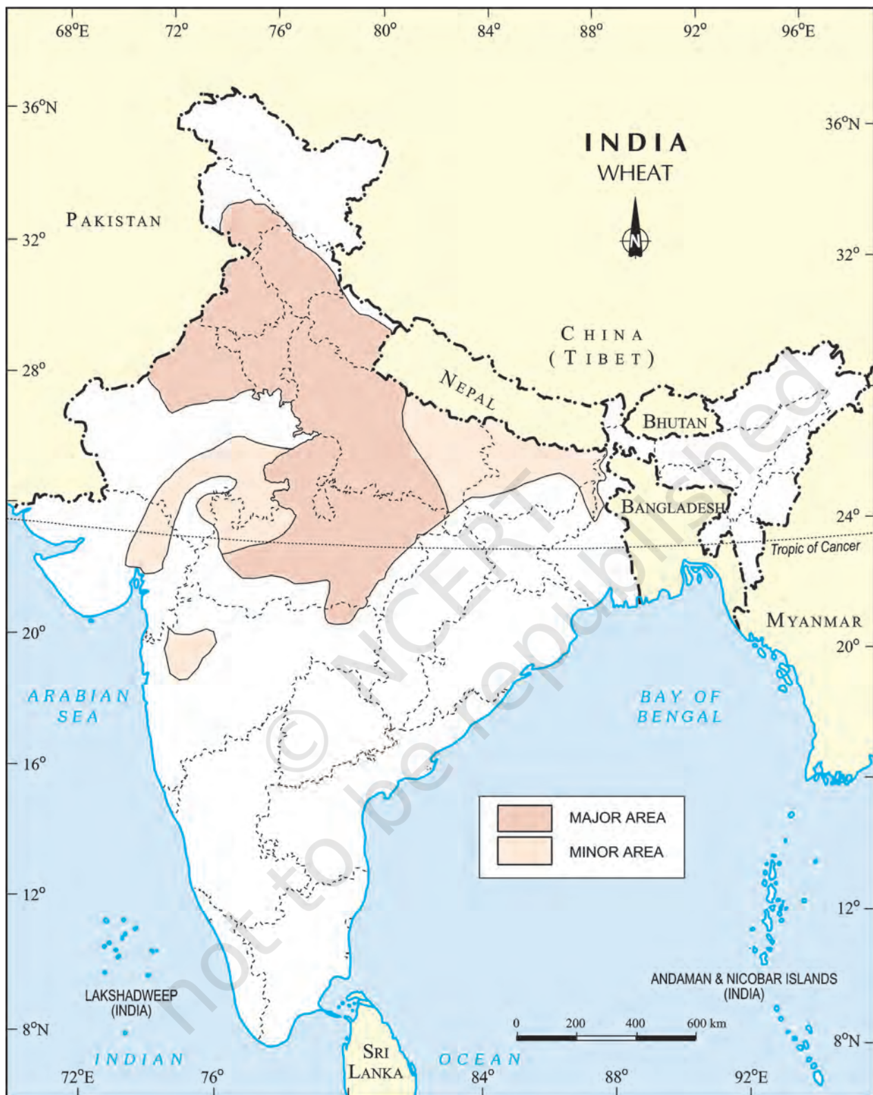
India: Distribution of Wheat