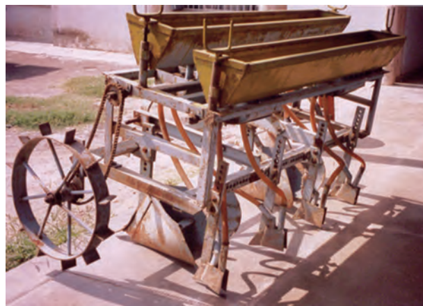
Fig. 4.15: Modern technological equipments used in agriculture

reforms. Provision for crop insurance against drought, flood, cyclone, fire and disease, establishment of Grameen banks, cooperative societies and banks for providing loan facilities to the farmers at lower rates of interest were some important steps in this direction.