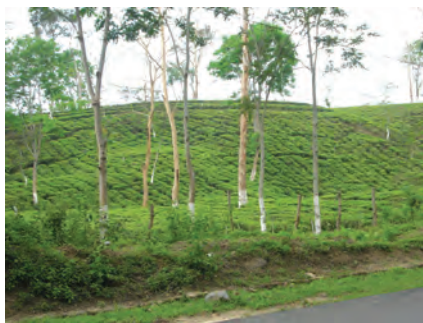
Fig. 4.10: Tea Cultivation

Coffee: Indian coffee is known in the world for its good quality. The Arabica variety initially brought from Yemen is produced in the country. This variety is in great demand all over the world. Initially its cultivation was introduced on the Baba Budan Hills and even today its cultivation is confined to the Nilgiri in Karnataka, Kerala and Tamil Nadu.