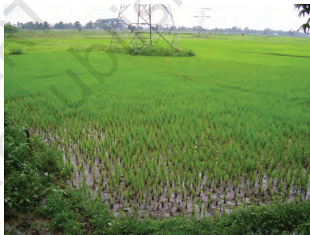
Fig. 4.4 (a): Rice Cultivation

Rice: It is the staple food crop of a majority of the people in India. Our country is the second largest producer of rice in the world after China. It is a kharif crop which requires high temperature, (above 25°C) and high humidity with annual rainfall above 100 cm. In the areas of less rainfall, it grows with the help of irrigation.