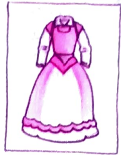
lavish very grand