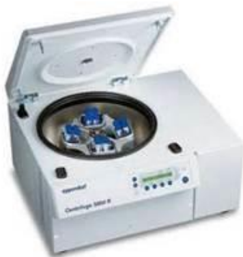
Centrifuge (a device for centrifugation)

Q.6. When blue ink is heated, what do you think has got evaporated from the watch glass?