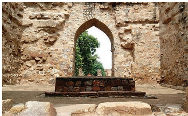
Ala-ud-din's Tomb (New Delhi)

Ala-ud-din nominated his eldest son Khizr Khan, as his successor. However, Ala-ud-din's confidant at that time was Malik Kafur. So Malik Kafur himself assumed the authority of the government. But Kafur's rule lasted only thirty-five days as he was assassinated by hostile nobles. Thereafter there were a series of murders which culminated in Ghazi Malik, a veteran of several campaigns against the Mongols, ascending the throne of Delhi in 1320 as Ghiyas-ud-din Tughlaq. He murdered the incumbent Khalji ruler Khusrau and thereby prevented anyone from Khalji dynasty claiming the throne. Thus began the rule of the Tughlaq Dynasty, which lasted until 1414.