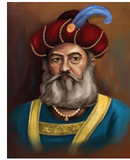
Muhammad Ghori (modern representation)

If Ghaznavid invasions were intended for loot, the Ghurids enlarged their scope to establish garrison towns to ensure the regular flow of plunder and tribute. Muizzuddin Muhammad of the