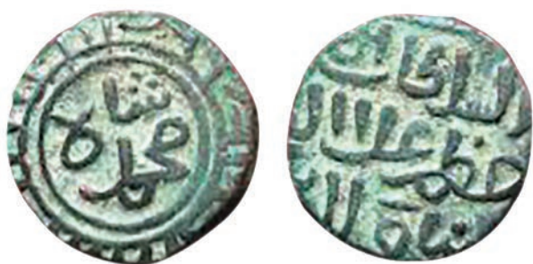
Copper coin of Ala-ud-din Khalji

gift, or as a religious endowment be brought back under the royal authority and control. He curbed the powers of the traditional village officers by depriving them of their traditional privileges. Corrupt royal officials were dealt with sternly. The Sultan prohibited liquor and banned the use of intoxicating drugs. Gambling was forbidden and gamblers were driven out of the city. However, the widespread violations of prohibition rules eventually forced the Sultan to relax the restrictions.