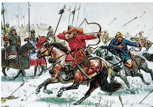
Attack of Mongols