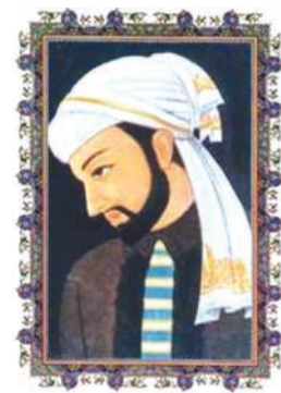
Amir Khusrau (modern representation)

Amir Khusrau emerged as a major figure of Persian prose and poetry. Amir Khusrau felt elated to call himself an Indian in his Nu Siphir ('Nine Skies'). In this work, he praises India's climate, its languages – notably Sanskrit – its arts, its music, its people,